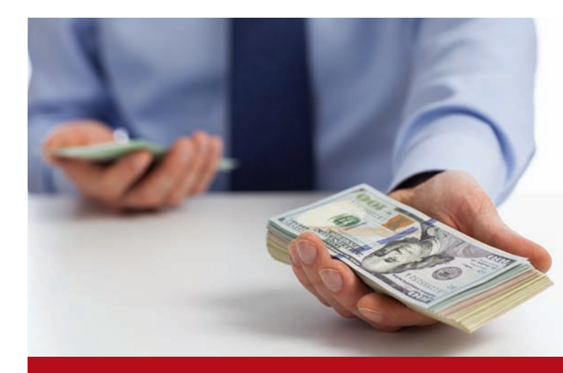
Mental accounting also causes people to treat money differently based on its source.

If you, like most people, answered "yes" to question 1 and "no" to question 2, you are susceptible to the mental accounting bias.<sup>4</sup>